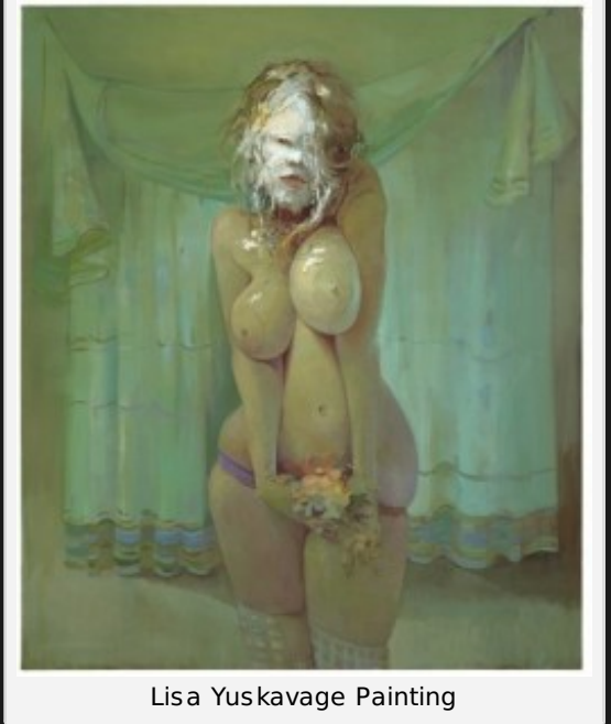
Lisa Yuskavage Painting

something. Getting over something that isn't working. Perfection has never been the path i've chose to travel, because this reality is not right in the first place. To me right is good perfection is done ... i'm not done / america is not right